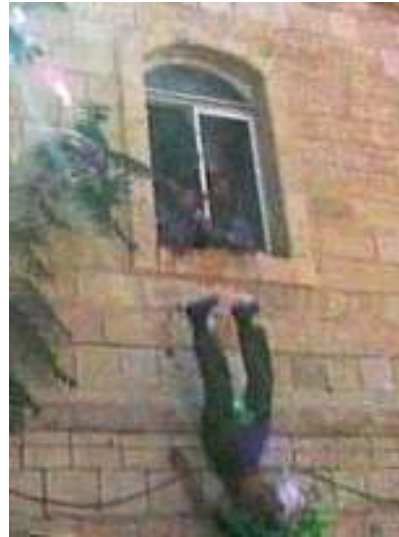
Pictures of the lynch of the reservists on Oct. 12, 2000

This is the story of the school visit as reported in Zayzafuna , a PA-funded educational youth magazine, which is published with the sponsorship of the PLO's Palestinian National Committee for Education, Culture and Sciences, and has the PA Deputy Minister of Education on the advisory board: