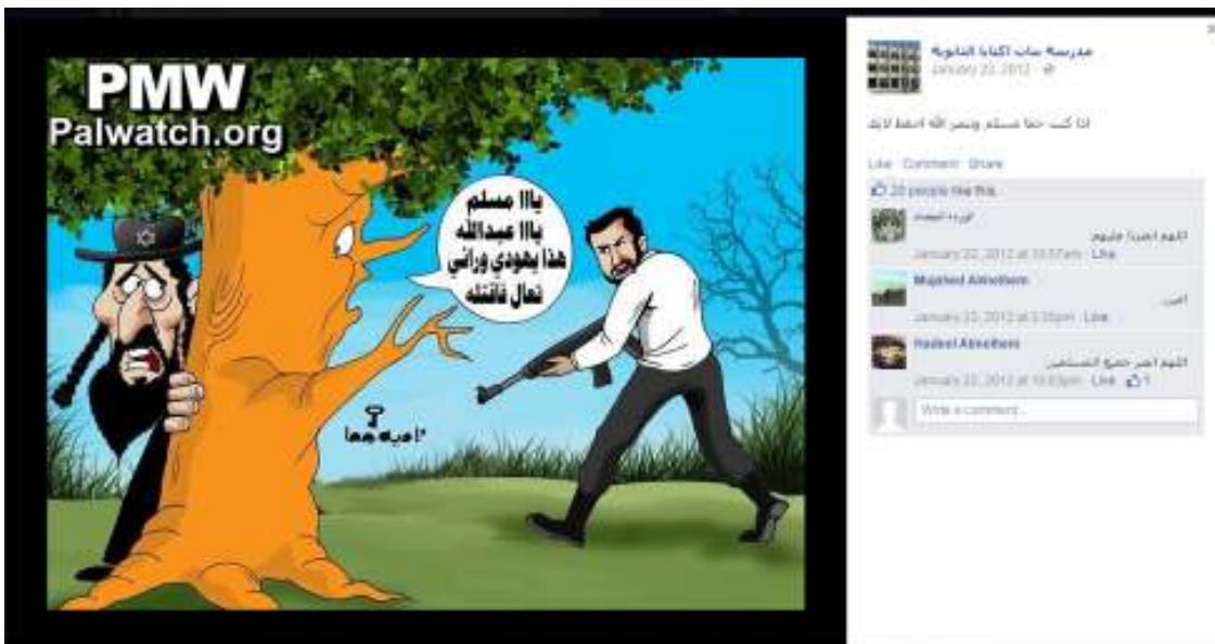
[Facebook page of Al-Khansa Elementary School for Girls in Jenin, Nov. 17, 2012; Facebook page of Bethlehem High School for Girls, Nov. 17, 2012; Facebook page of the Iktaba High School for Girls in Tulkarem, Jan. 22, 2012]

“O Muslim, servant of Allah! There is a Jew behind me, come and kill him.”