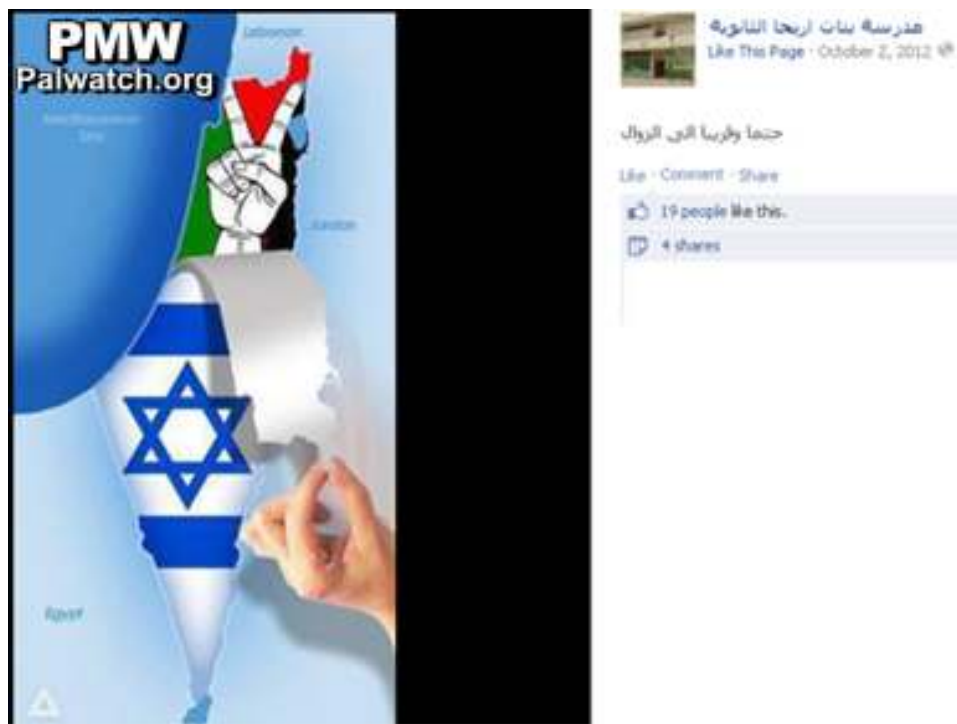
[Facebook page of the Jericho High School for Girls, Oct. 2, 2012]

Schools also teach Palestinian children to anticipate a future without Israel. One example is the Jericho High School for Girls, which posted on its Facebook page this image showing Israel being replaced by "Palestine." The area shown covered by the Palestinian flag is Northern Israel, not parts of the West Bank or the Gaza Strip: