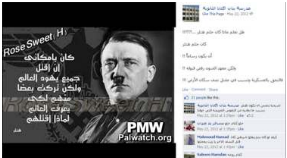
[Facebook, Iktiba High School for Girls, May 22, 2012]

“Hitler said: ‘I could have annihilated all of the Jews in the world, but I left a few so that you would know why I annihilated them’”