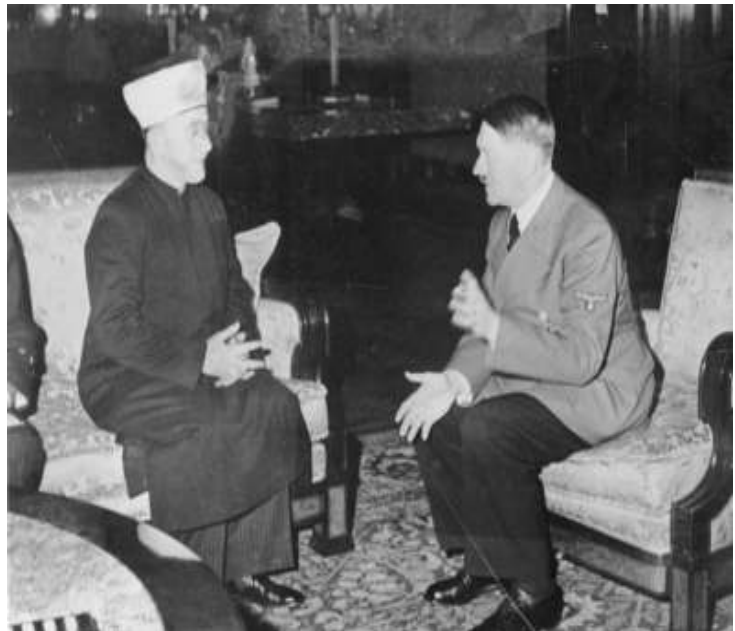
Amin Al-Husseini with Hitler

Amin Al-Husseini was the Grand Mufti of Jerusalem at the time of the British Mandate. During World War II he moved to Berlin, was a Nazi collaborator and associate of Hitler. Al-Husseini was on Yugoslavia's list of wanted war criminals, and was responsible for a Muslim SS division that murdered thousands of Serbs and Croats. When the Nazis offered to free some Jewish children Al-Husseini fought against their release and 5000 children were sent to the gas chambers.