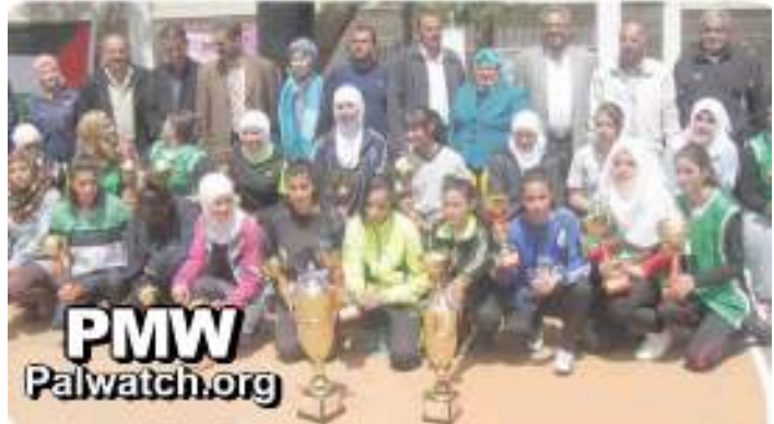
Picture of youth who participated in tournament named for murderer of 15