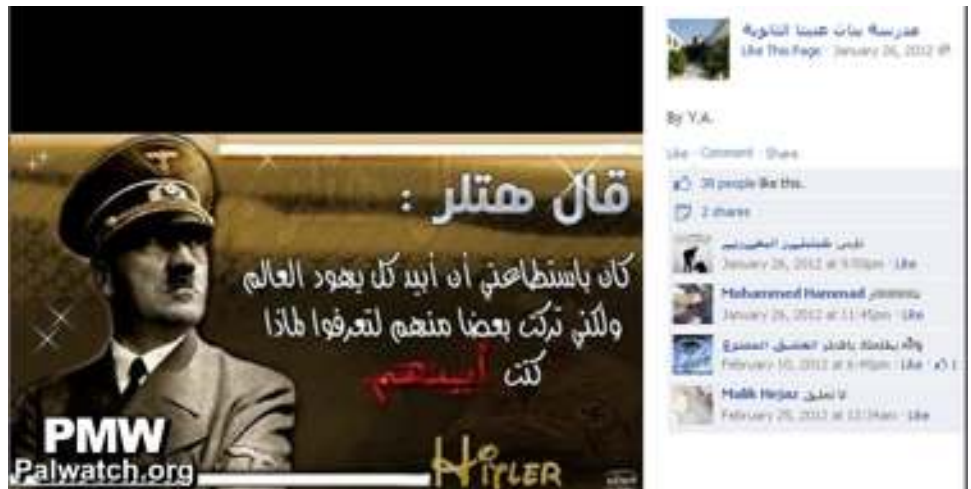
[Facebook, Anabta High School for Girls, Jan. 26, 2012]

“Hitler said: ‘I could have annihilated all of the Jews in the world, but I left a few so that you would know why I annihilated them’”