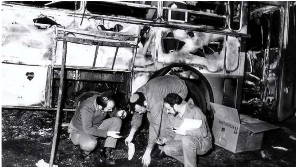
Picture of the bus after the hijacking and murder of passengers by Mughrabi's group

Terrorist Dalal Mughrabi led the most lethal terror attack in Israel's history, known as the Coastal Road massacre, in 1978, when she and other Fatah terrorists hijacked a bus on Israel's Coastal Highway, killing 37 civilians, 12 of them children, and wounding over 70.