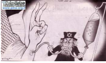
[ Al-Hayat Al-Jadida (Fatah), Dec. 31, 2004]