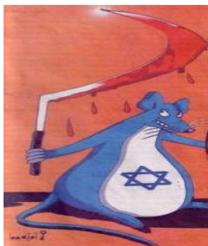
[ Al-Ayyam , March 27, 2004]

Complementing the verbal depiction of Jews as animals and Satan are visual demonization and dehumanization in the PA media. Note that long before the terror war, the PA media was already publishing these odious visual images of Jews. In 1999, approaching the end of the century, the cartoon of the official PA daily captioned the sub-human dwarf Jew as “the disease of the century.”