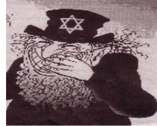
[ Al-Ayyam , April 5, 2003]

This dehumanization of Jews plays a role in preparing PA society to be willing to kill Jews (see Stage 3 below.) Animals are clearly inferior to humans, and in many societies have no rights, are used for experiments and routinely hunted.