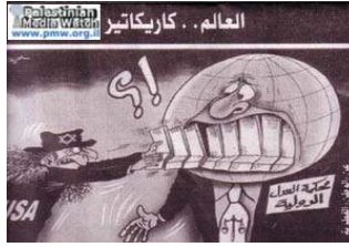
[ Al-Ayyam , Feb. 27, 2004]