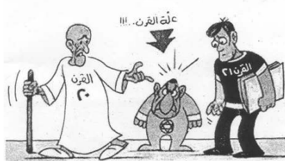
“Disease of the century” [ Al-Hayat Al-Jadida (Fatah), Dec. 28, 1999]