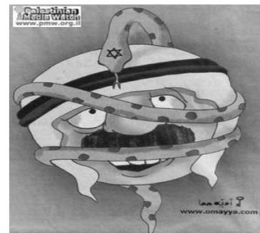
[ Al-Quds , March 7, 2004]