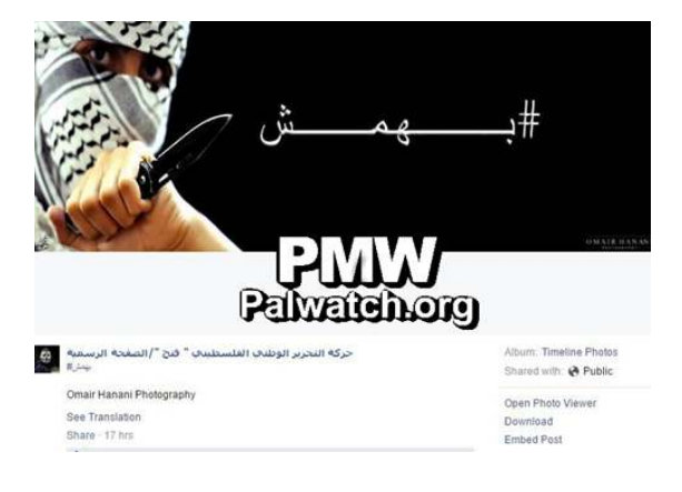
Text on photo: "#so_what" [Official Fatah Facebook page, Nov. 7, 2015]