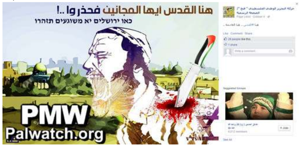
Text: "Here is Jerusalem, you crazies, beware!" [Official Facebook page of the Fatah Movement, Oct. 4, 2015]

Right at the beginning of the terror campaign, Abbas' Fatah movement warned Jews of stabbings in this cartoon, and thus made clear what actions it expected from Palestinians: