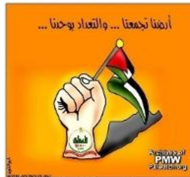
Text: "Our land brings us together... and the census unites us..."

[PA TV (Fatah), Nov. – Dec. 2007, PA official website, 2007- 2009]