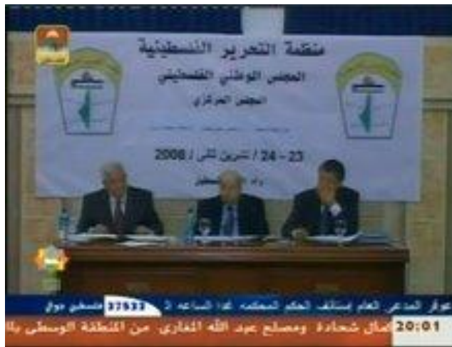
PA Chairman Mahmoud Abbas at PLO Central Committee meeting in 2008.

9. Similarly, PA TV (Fatah) routinely broadcasts pictures of Abbas with the PLO symbol, which places the Palestinian flag over the map of all of Israel, prominently displayed in the background. The picture below appears in a music video honoring Abbas which has been broadcast numerous times a week since 2008.