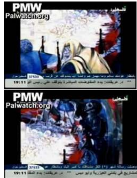
[PA TV (Fatah), July 28, 2010]

“At the beginning of the 20 th century, the European colonialists – especially Britain – found that their interests fit the aspirations of the developing World Zionist Movement, and they began to offer their patronage and support, not only with promises, but with all means that would allow this racist movement [Zionism] to realize its primary goal: the establishment of a Jewish entity upon the land of Palestine, at the expense of the authentic Palestinian Arab nation... The Palestinian National Authority was established on some of the Palestinian areas, seeking to establish an independent Palestinian state on the West Bank and in the Gaza Strip, on condition that its capital would be Jerusalem. However, the oppressive Zionist enemy never missed an opportunity to shatter the Palestinian dream.”